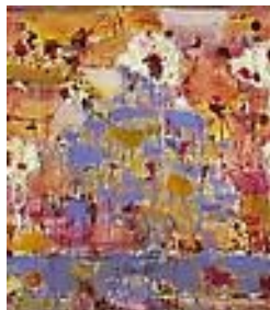
Abstract Poetry on 25th Street by Lance Esplund, New York Sun