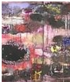
Her Intelligent Paintings Are Works of 'Genius'