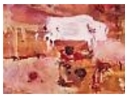
Seasons, Fields, Dreams: Artists and the Landscape by Lance Esplund, Modern Painters