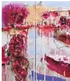
A Hidden Reserve by Achim Hochdorfer, Artforum