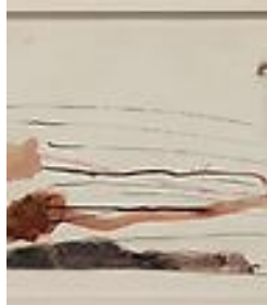
Joan Snyder at Solway-Jones Gallery by David Pagel, Los Angeles Times